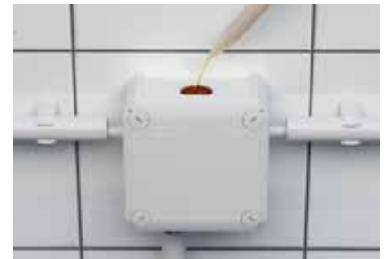
Flexible application: junction box casting from above