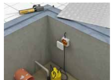
Aquasit can be used to protect those electrical installations, which could be damaged by extreme or continuous moisture.