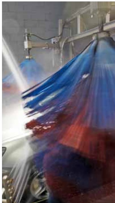
Reliable protection against moisture, mechanical shocks and vibrations – even under the toughest installation conditions

The application is simple: Aquasit is cast simply and tidily using a standard cartridge pistol. The transparent, amber-coloured cold casting compound, based on carbon resins, then sets to a soft elastic. Aquasit is “self-healing” and can also be removed easily.